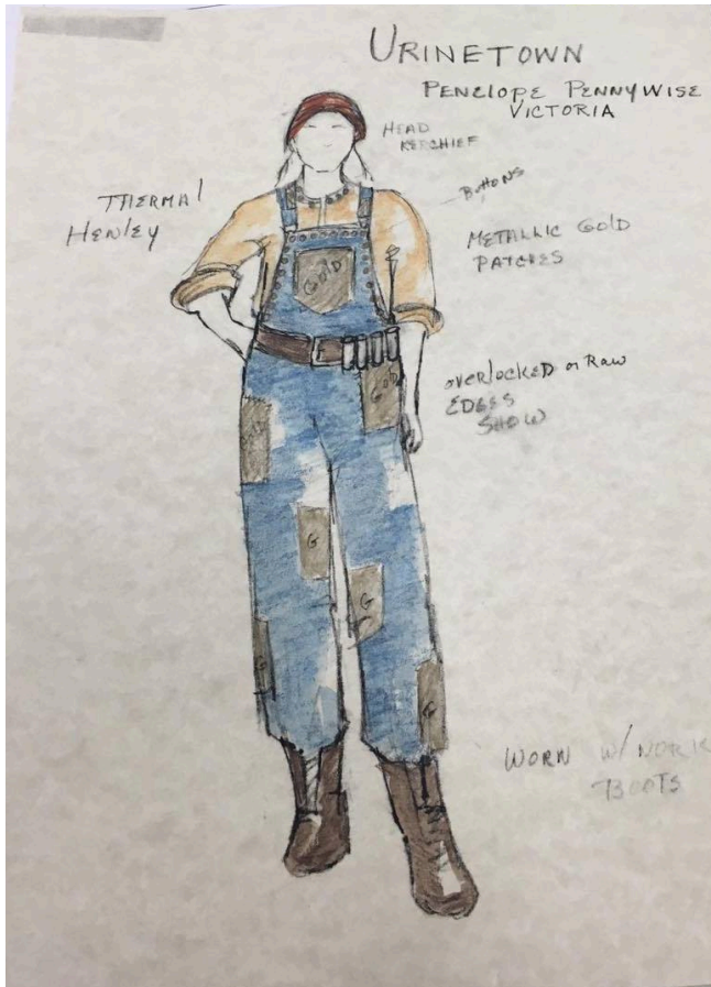
Costume Sketch #1

‘glamor’. This way, Penny is able to show off her status and the money that she has worked so hard for, without sacrificing the comfort and ease of her work uniform.